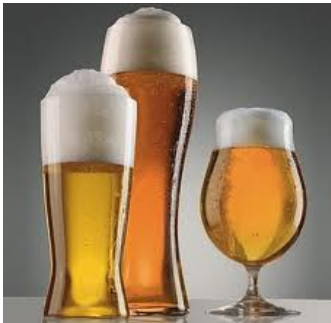
Handcrafted Ales & Lagers