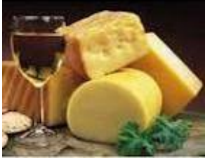
Wine and Cheese Tasting available Add $3.00 per person option 1